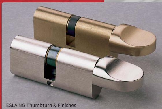
ESLANG NG Thumbturn & Finishes

All Cylinders available in Satin Chrome & Polished Brass except Rim Mortice which is available Satin Chrome only.