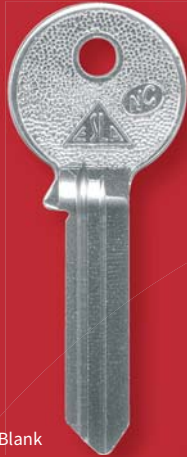
ESLANG NG Genuine Blank

S E C U R I T Y 6 P I N C Y L I N D E R S