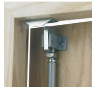
Top Pullman latch