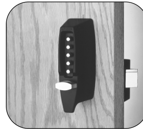
Rim Deadlocking Latch

Models 7004, 7014 Deadlocking Latch 1/2" (13 mm) throw, flat front Primary or auxiliary Lock Automatic relock